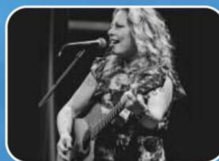
Live Music Every Friday