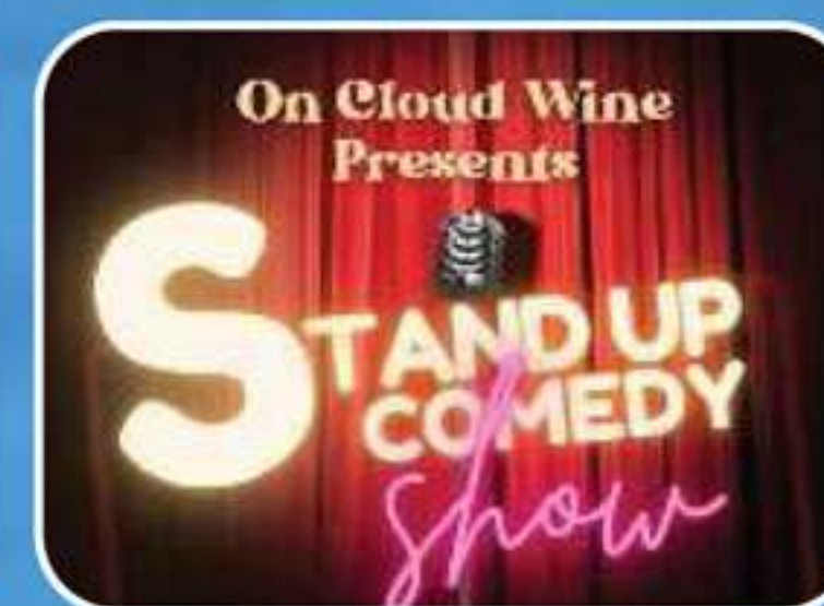
Stand-Up Comedy two Saturdays a Month